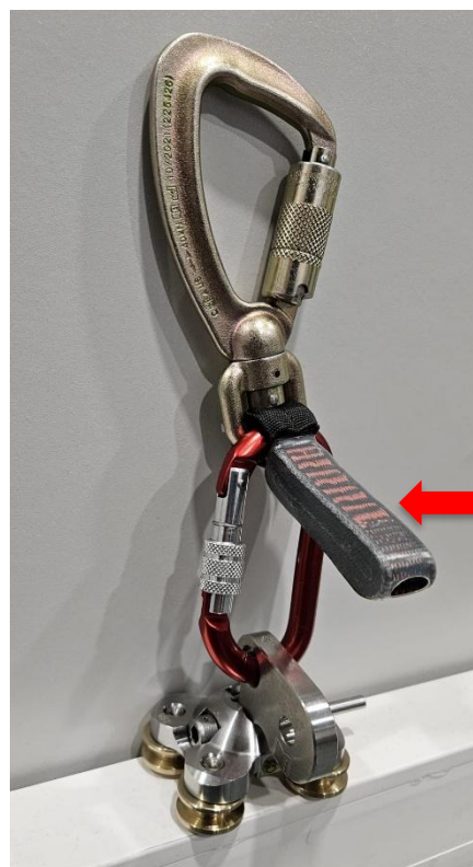
Non-compliant energy absorber

Discontinuation of use and quarantine of batches of VST2 VG11 fall arrest carriage from NEW TECHNELEC assembled in May 2024 (reference 10/2021) due to non-compliance of a batch of SKYLOTEC energy absorbers with a proven risk to the end user. Immediately stop using the carriages affected by this recall.